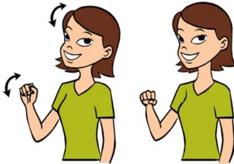
Yes in baby sign language