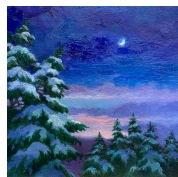
"Winter Evening," Oil, 14" x 14", $300