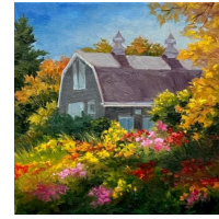
"Bayard Beauty," Oil, 14" x 14", $300