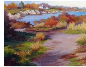
"Autumn Path, Narragansett," Oil, 17" x 20", $550