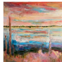
"Sunset on the Pier," Oil on Canvas, 20" x 20", $300