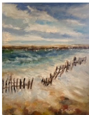
"Snow Meets the Ocean," Oil on Canvas, 20" x 16", $350