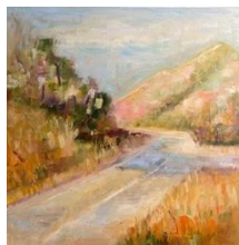
"The Road Not Taken," Oil on Canvas, 20" x 20", $300