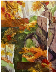
"Autumn Woods Collage," Watercolor & Collage, 24" x 20", $450