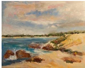
"The Dunes in Fall, Oil on Canvas, 20" x 16", $200