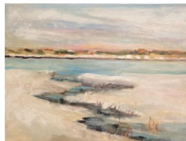
"Prayer for Peace," Oil on Canvas, 18" x 24", $450