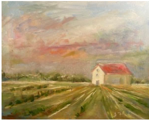
"Farm Field at Dusk," Oil on Canvas, 20" x 16", $300