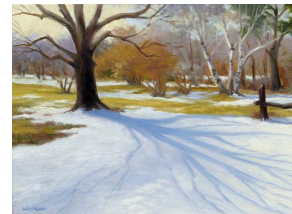
"Winter's End, Planting Fields," Oil, 18" x 22", $550