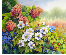
"Summer's End," Watercolor, 24" x 28", $800