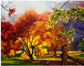
"Autumn Blaze, Planting Fields," Watercolor, 22" x 26", $550