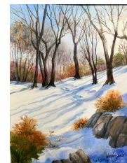
"Winter Shadows," Watercolor, 18" x 24", $350