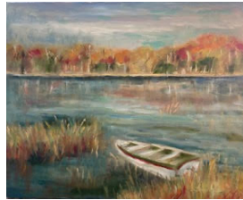
"The Lone Boat Kept on Lake," Oil on Canvas, 16" x 20", $300