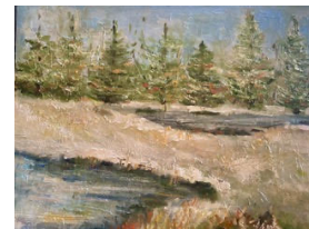
"Winter Solstice," Oil on Canvas, 16" x 20", $250