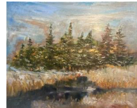
"Winter Pond Reflections," Oil on Canvas, 16" x 20", $250