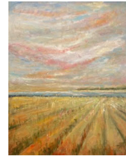
"First Snowfall on the Field," Oil on Linen, 16" x 20", $300