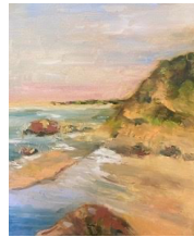
"The Cliffs Off Iron Pier," Oil on Canvas, 16" x 20", $250