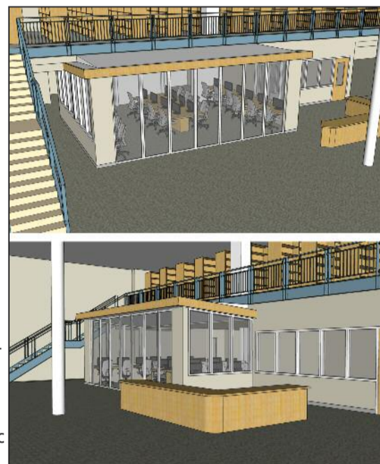
Rendering of technology makerspace

During the next several months, library users will witness a transformation in the Adult Library as we relocate the traditional reference collection to make way for a reimagined space dedicated to public access to new technologies. The new space will enable us to offer significantly more tech-related programs and relevant learning opportunities for our community. The technology-learning center will be equipped with high-end computers — both Mac and PC — featuring digital media and production software, desktop publishing, 3-D printing, and drafting software to name a few possible examples. A high quality scanner and wide carriage printer will enable users to capture and output their work to a variety of formats. Plans also include shrinking the service desk and relocating existing public computers to increase public space in the seating area. The library has secured generous funding for this project through New York State Public Library facilities construction grants, thanks to the contin-